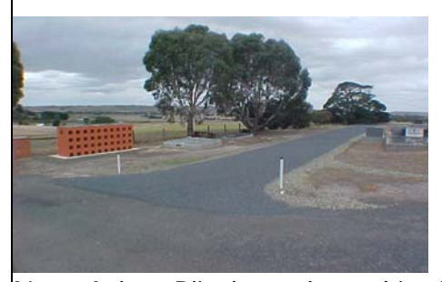
New Ashes Plinth and road in the Methodist section

Casterton is indeed indebted to Jim not only for his contribution to the cemetery but in many other roles in the town.