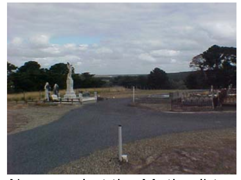
New road at the Methodist Section/Presbyterian Section