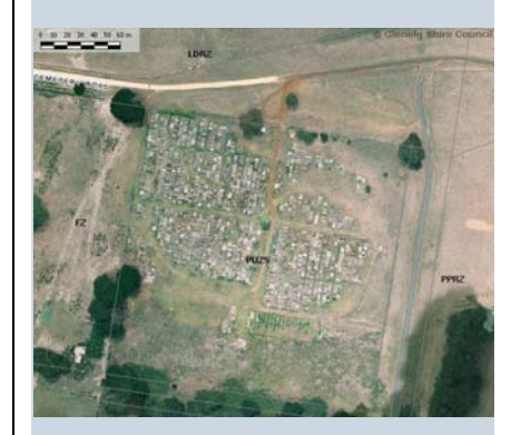
Casterton New Cemetery Aerial View

"It is not how much you do, but how much love you put in the doing."