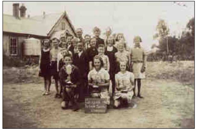
Carapook 1940 Schools' Sports Champions.

Many stories remain to be told. I hope that the trophies and rolls are intact somewhere and that the history of the school that served the district lives on.