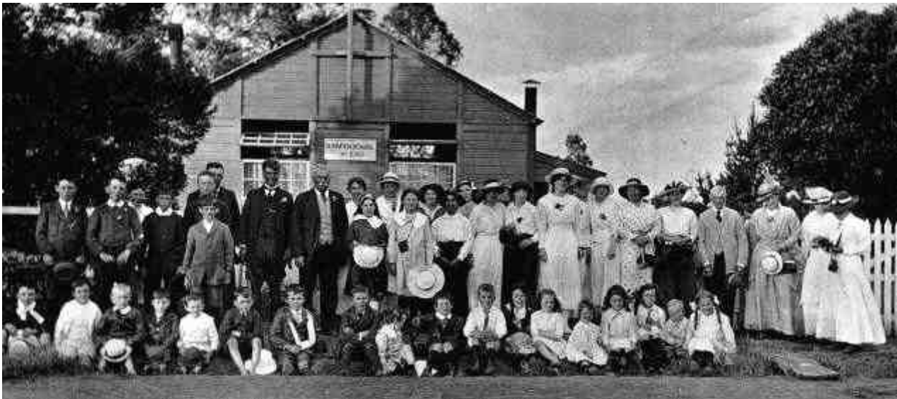
Nareen State School 1919