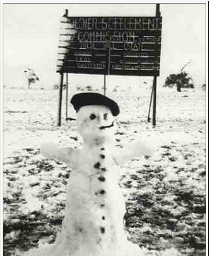
This picture seemed to be in keeping with the current spell of weather! Taken at the Solider Settlement at Tulse Hill about 1950.

Contact Jan (03) 5581 - 2743 (note change of number)