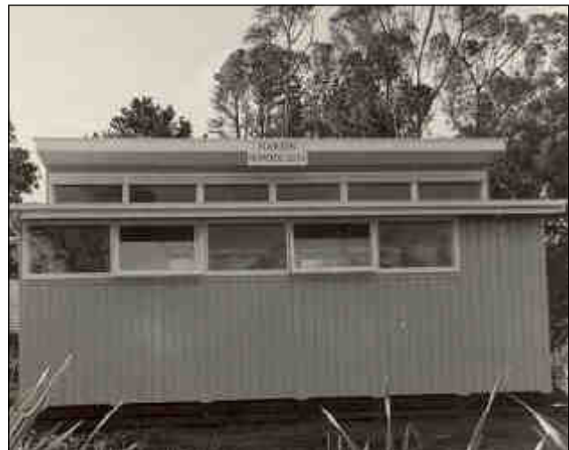
Nareen School 1960