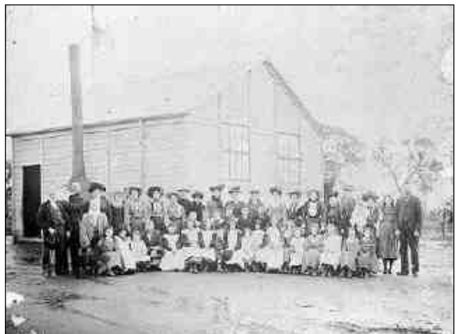
Nareen School 1902