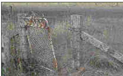
One identifiable feature of State School 1969 is the front gate shown in this 2002 photograph.