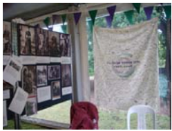
Our banner displayed before it will be sewn together with the other banners from around the state.