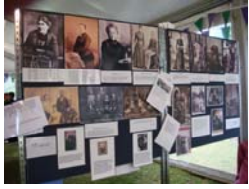
Our display at the Womens Suffrage finale held at Parliament House on the 23 rd November, 2009