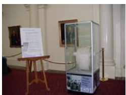
The original petition on display in Parliament House as part of the final celebrations.