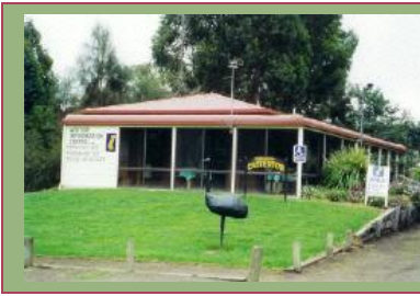
Visitor Information Centre