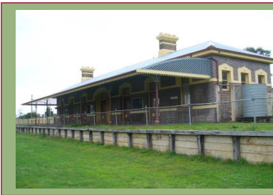
Casterton Community Museum