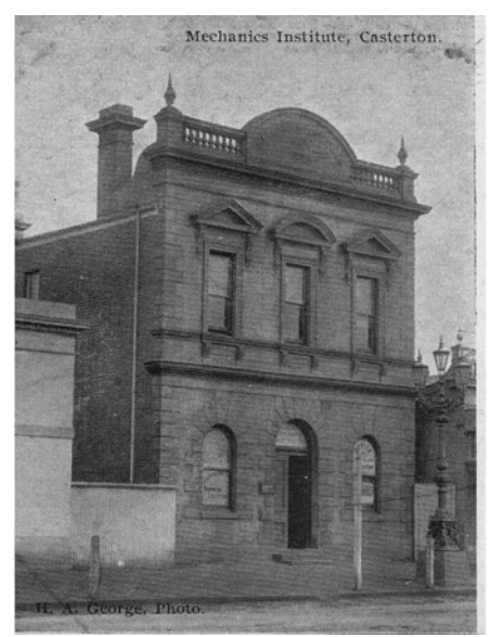
Casterton Mechanics Insitute, 1891

Next meeting May 16<sup>th</sup>, RSL clubrooms 2pm