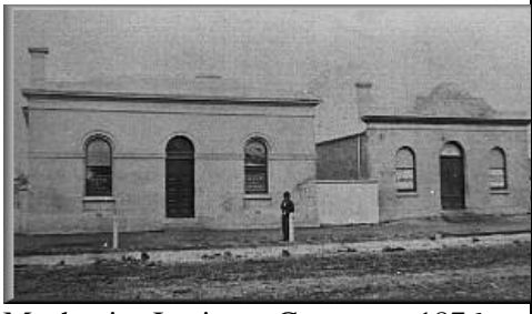
Mechanics Institute, Casterton, 1876