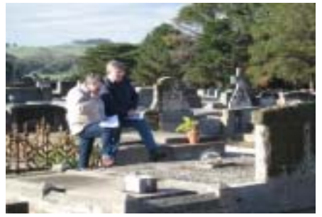
New Cemetery Mapping Project