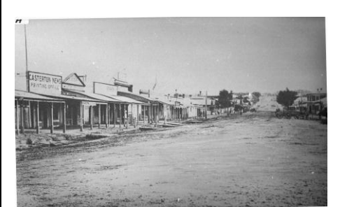
Henty Street - 1890s

Due to the great interest in Jim Kent's book published November 2011, copies sold out immediately. A new printing is available at the Visitor Information Centre – we will publish a new edition of articles late in 2013.