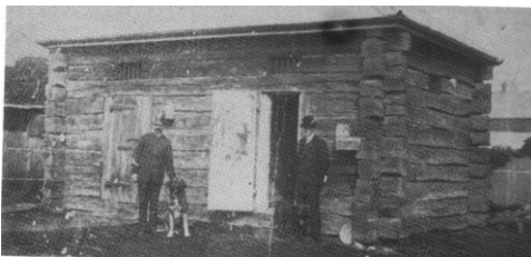
The Logs gaol, Henty Street, demolished c 1907