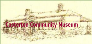
Post office 1897