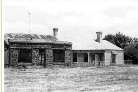
Sandford shop 1981