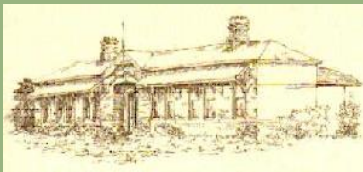
Casterton Community Museum