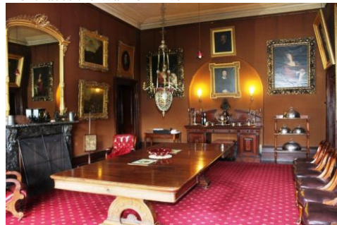
Dining room and ancestral portraits / Library