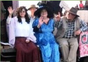
Kelpie parade 2014