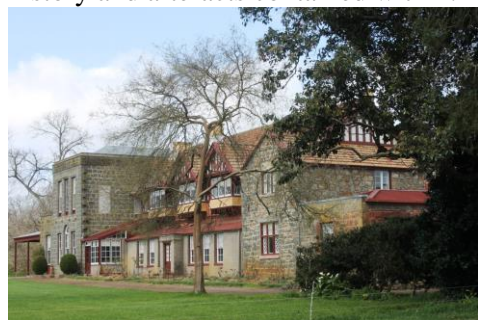
Front faces the Wannan River