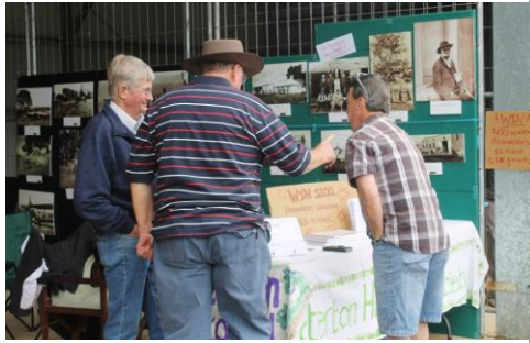
Noel demonstrates the art of salesmanship