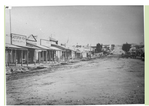
Henty Street - 1890s